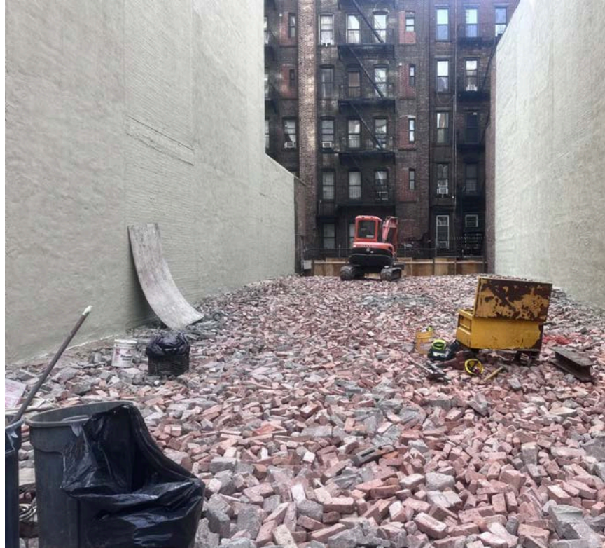
222 East 86th Street.