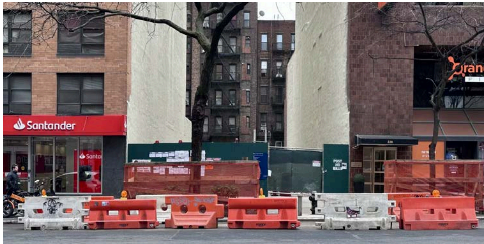
222 East 86th Street.

The following photos show the site cleared of its former occupant and masonry rubble scattered across the rectangular parcel. A lone excavator remains on the property from the demolition.