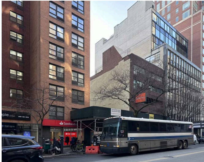
222 East 86th Street.

The below Google Street View image shows the former occupant before its demolition.