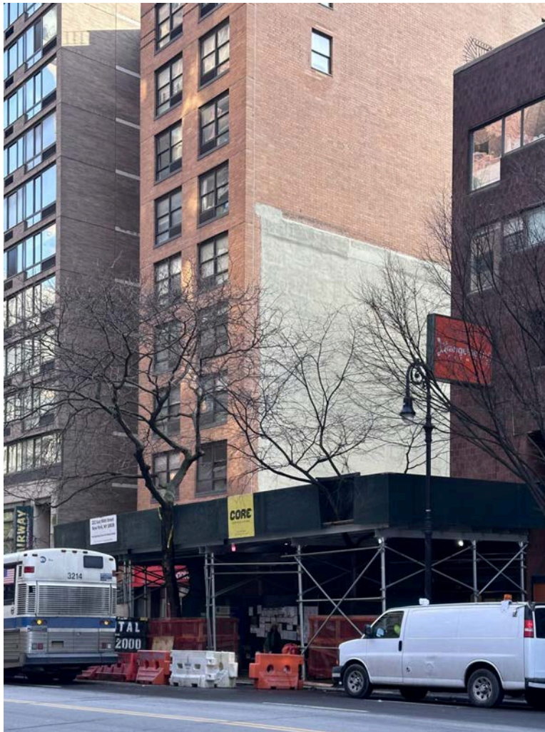
222 East 86th Street.

Additional photographs below show the site at the beginning of the year when crews were in the process of dismantling the ground level of the former 99-year-old building. The sidewalk shed has since been removed.