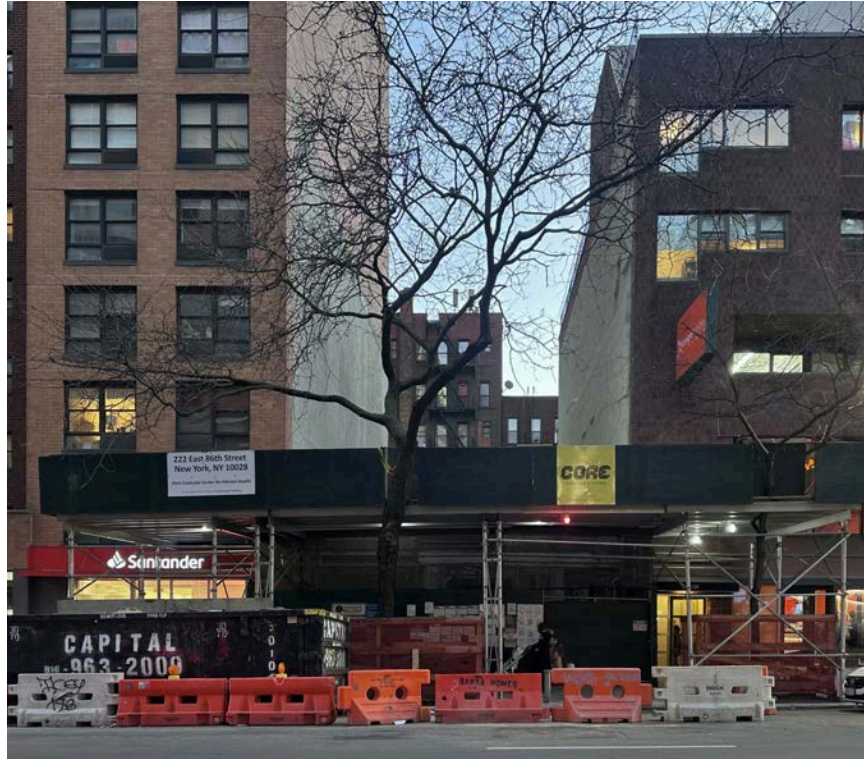
222 East 86th Street.