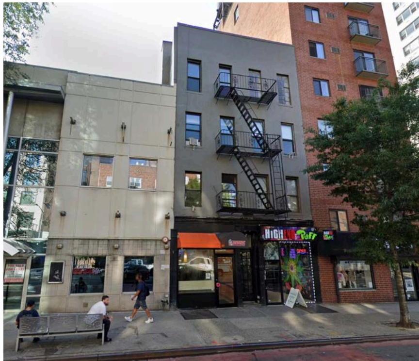
1482-1484 First Avenue

The below Google Street View image shows the appearance of the occupants before work began.