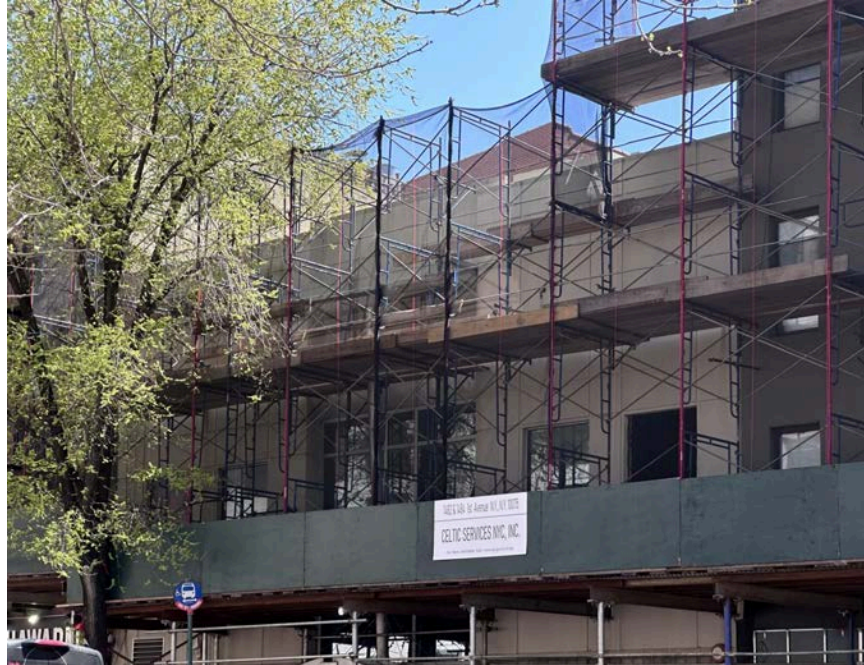
1482-1484 1st Avenue.

The below Google Street View image shows the appearance of the occupants before work began.