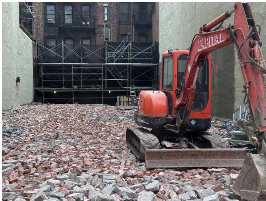
222 East 86th Street.