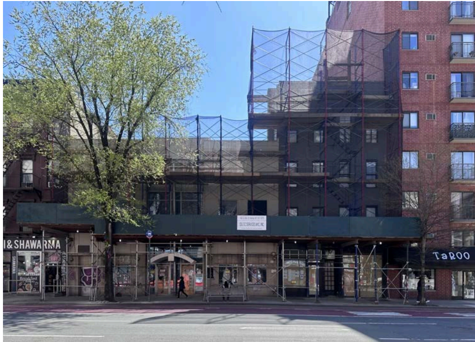
1482-1484 1st Avenue.