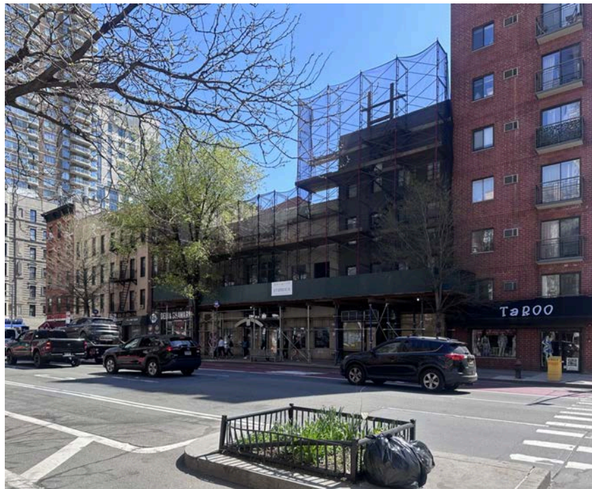
1482-1484 1st Avenue.