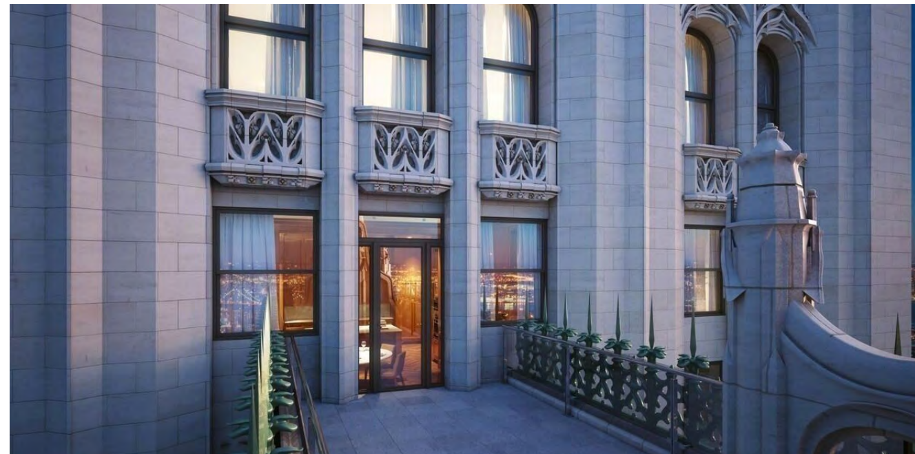
The Woolworth Tower Residences, NY