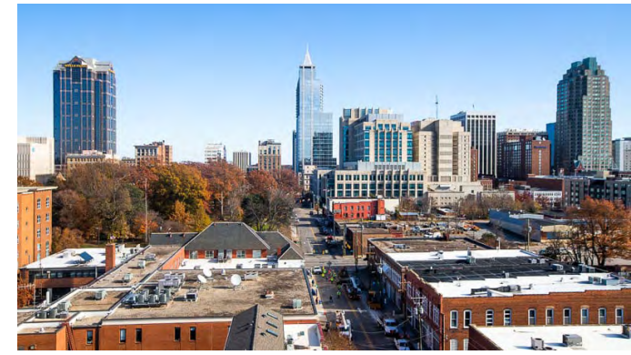
303 S. Dawson Street and 217 W. Martin Street Raleigh, NC Multifamily Development