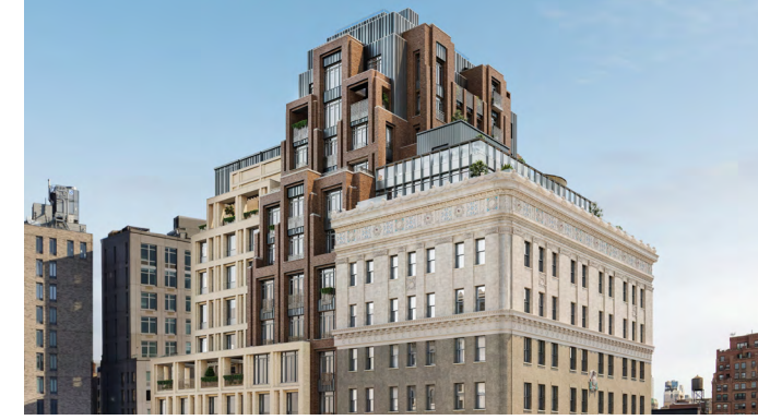
378 West End Avenue New York Luxury Condominium Ground Up Development 58 Residences