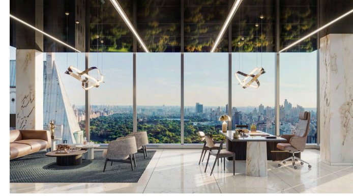
125 West 57th Street New York Ground-up Office Building Development 275,000 SF