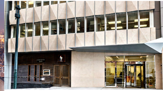
211 East 43rd Street New York Office Building Redevelopment and Repositioning 211,000 SF