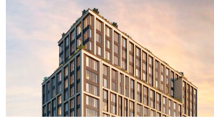
278 8th Avenue New York Residential & Mixed-Use Ground Up Development 215,000 SF