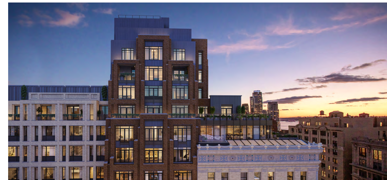
378 West End Avenue, NY

AEW Capital Management Alcion Ventures Angelo Gordon & Co. BlackRock Breakers Capital Cain International The Carlyle Group Clarion Partners Credit Suisse First Boston Daishin Securities The Davis Companies DLJ Capital Partners ING Realty Partners Jamestown Properties New Valley Prudential Real Estate Taconic Investment Partners W Financial