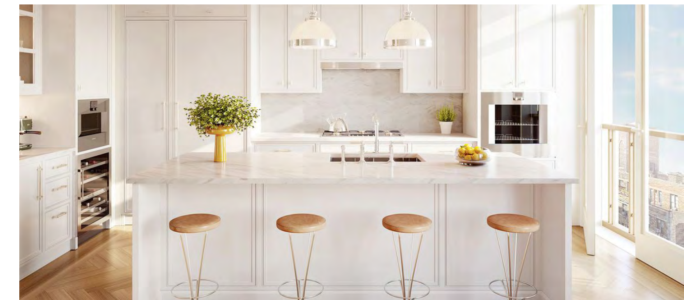
Two Fifty West 81st Street, NY