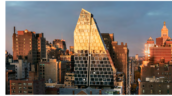
35XV New York Luxury Condominium Ground Up Development 56 Residences