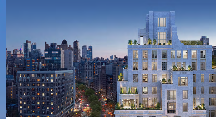
250 West 81st Street New York Luxury Condominium Ground Up Development 31 Residences