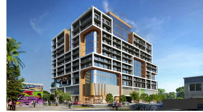
Wynwood, 18 NW 23rd Street Miami, FL Multifamily Development