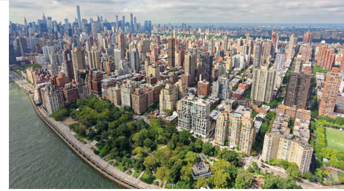
288 East 88th Street New York Residential & Mixed-Use Ground Up Development 107,500 SF