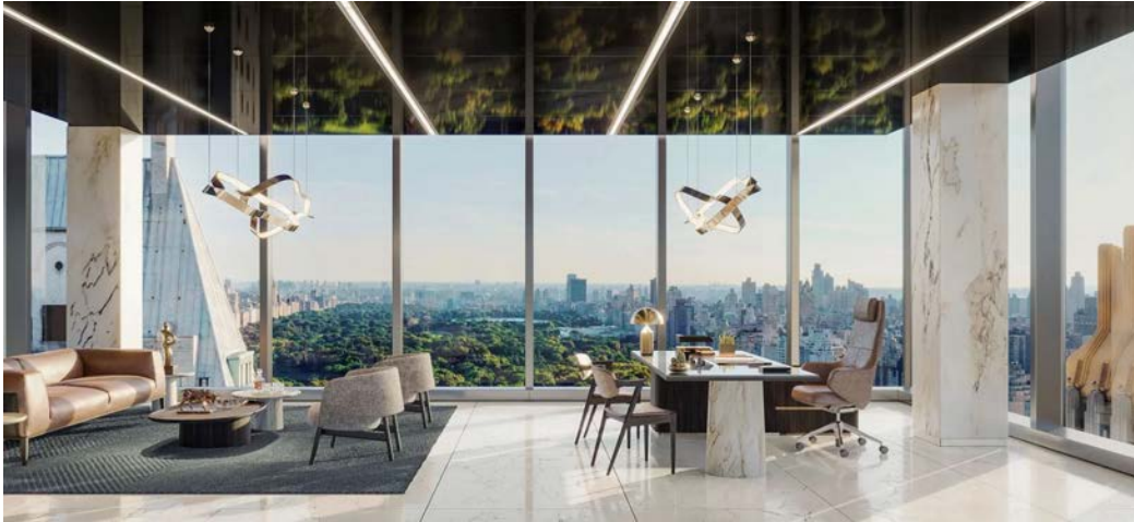
125 West 57th Street.

125 West 57th Street's completion date is scheduled for June 2025, as noted on site.