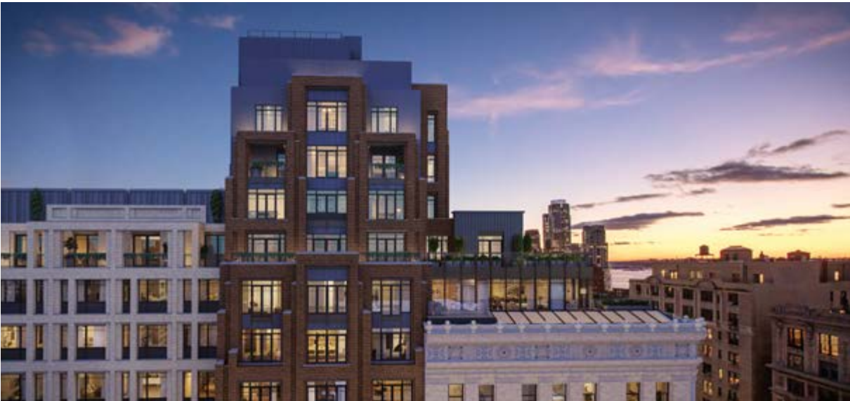
378 West End Avenue, NY