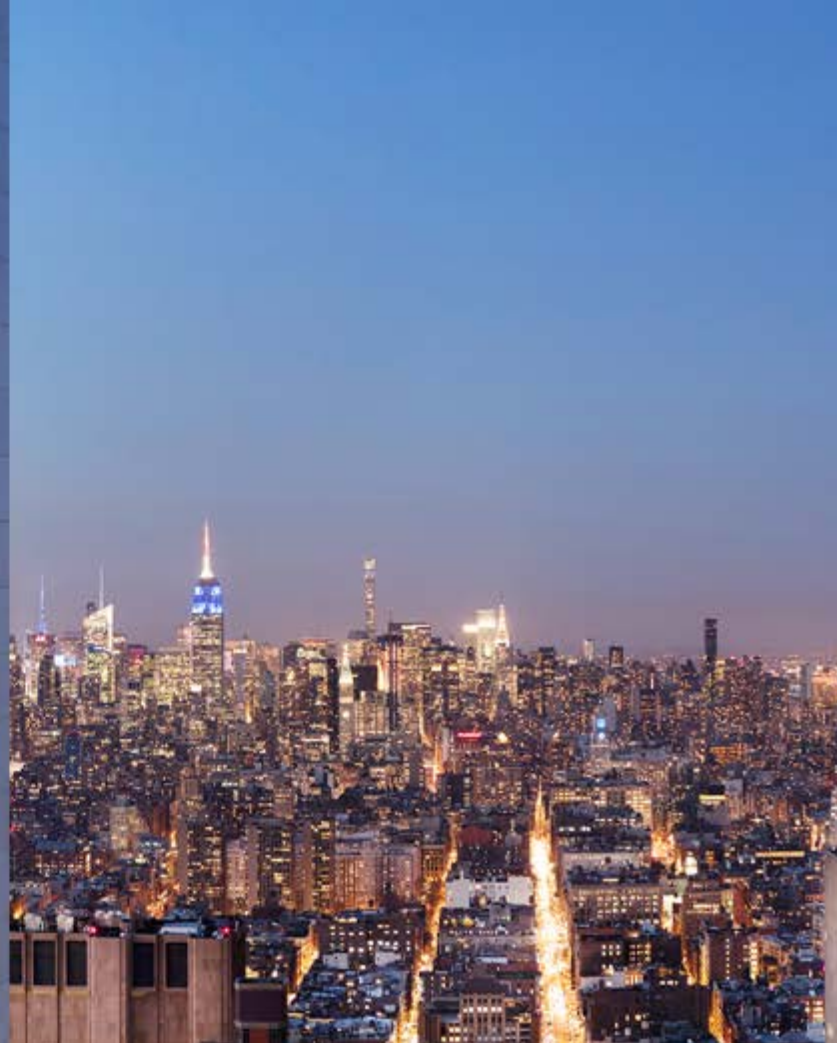
The Woolworth Tower Residences, NY