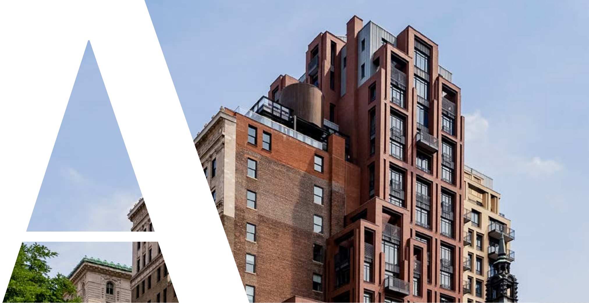
378 West End Avenue, NY