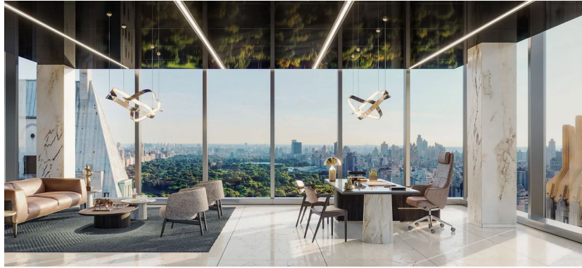
125 West 57th Street.

YIMBY last reported that office floor plates would span around 10,000 square feet apiece with ceiling heights of over 14 feet. On-site office amenities will include a lounge, a meeting space, a board room, and over 4,000 square feet of outdoor terrace space. Construction is expected to cost around $350 million and offices will start 180 feet above street level. JLL will be in charge of leasing and marketing, which will launch in early 2024.