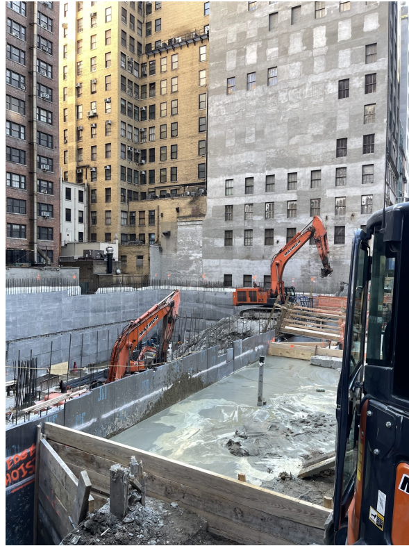
125 West 57th Street.