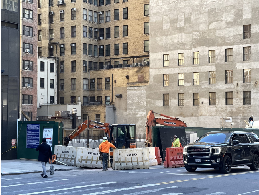
125 West 57th Street.