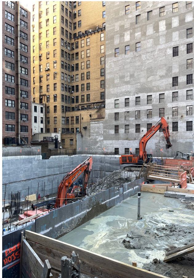
125 West 57th Street.