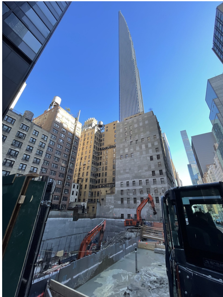
125 West 57th Street.

Excavation was picking up steam at the time of our last update in October, shortly after the former 16-story occupant of the plot had finished demolition. Since then, excavation has progressed far below street level and recent photos show the foundation walls and slabs spanning two levels below grade. A pair of excavators remain on site completing the final bits of unearthing, and several concrete trucks were seen making deliveries during the time of our visit. Sections of steel rebar protrude from the tops of the walls and at the locations of the interior columns around the center of the western half of the slab in preparation for subsequent pours. Based on the pace of progress, it's possible that the superstructure could begin to rise above street level sometime this summer.