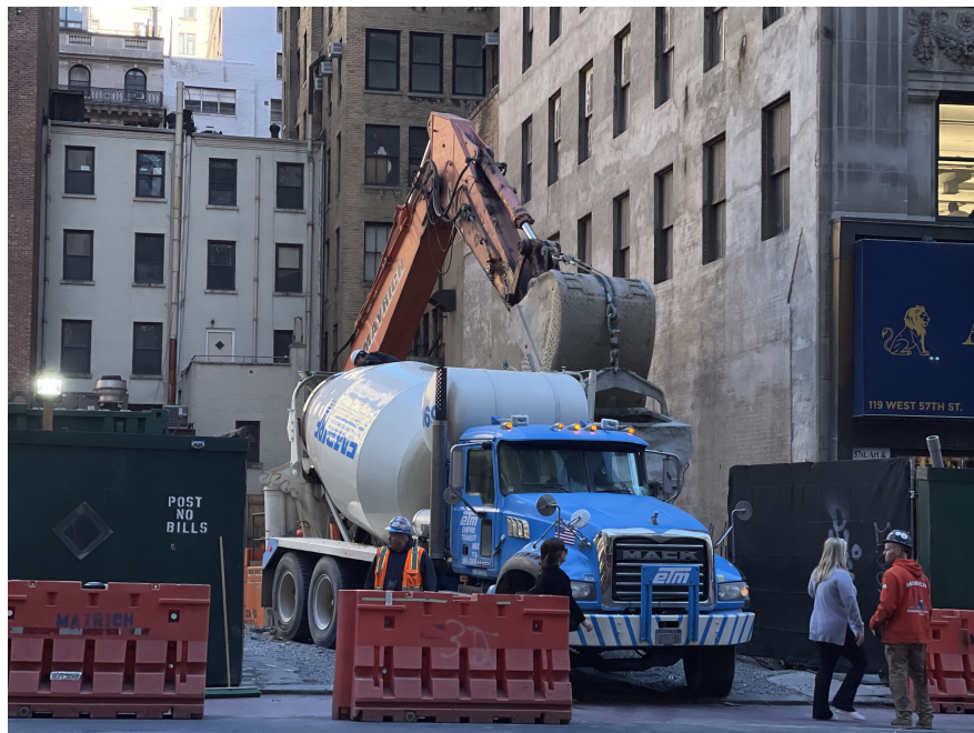
125 West 57th Street.