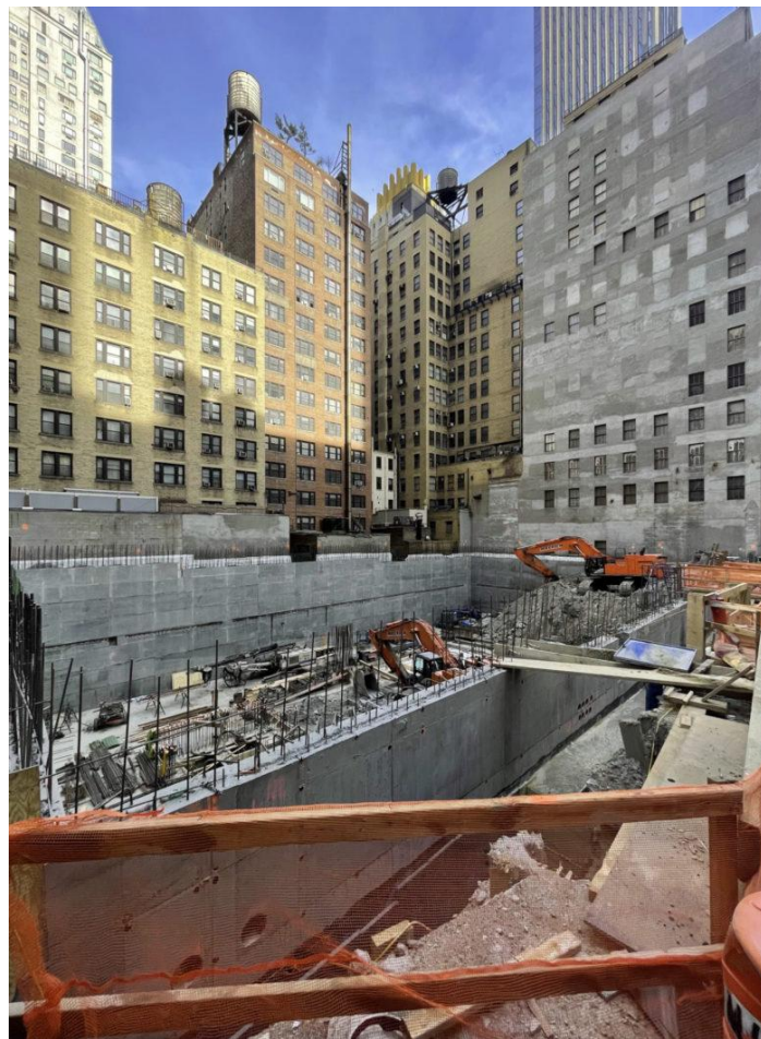
125 West 57th Street.

Foundation work is progressing at 125 West 57th Street , the site of a 26-story commercial building on Billionaires' Row in Midtown, Manhattan . Designed by FXCollaborative and developed by Alchemy-ABR Investment Partners , the 440-foot-tall structure will yield 185,000 square feet of Class A office space and a new ground-floor home for the Calvary Baptist Church, which has operated on the site since 1883.