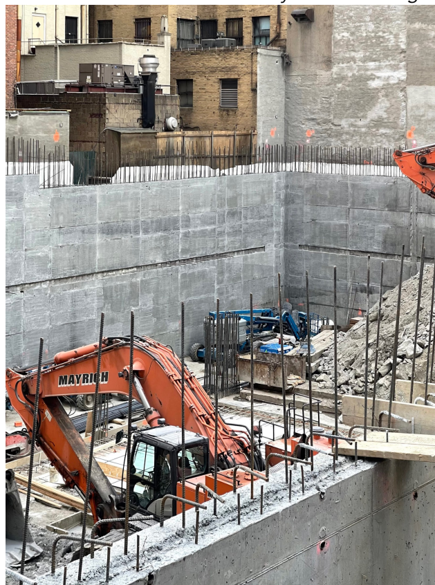
125 West 57th Street.