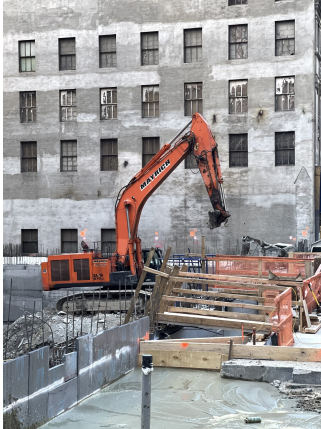
125 West 57th Street.