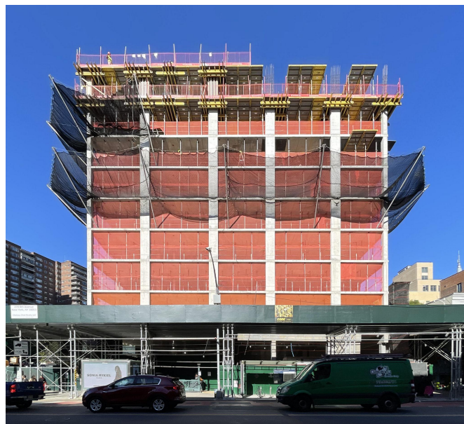
278 Eighth Avenue.