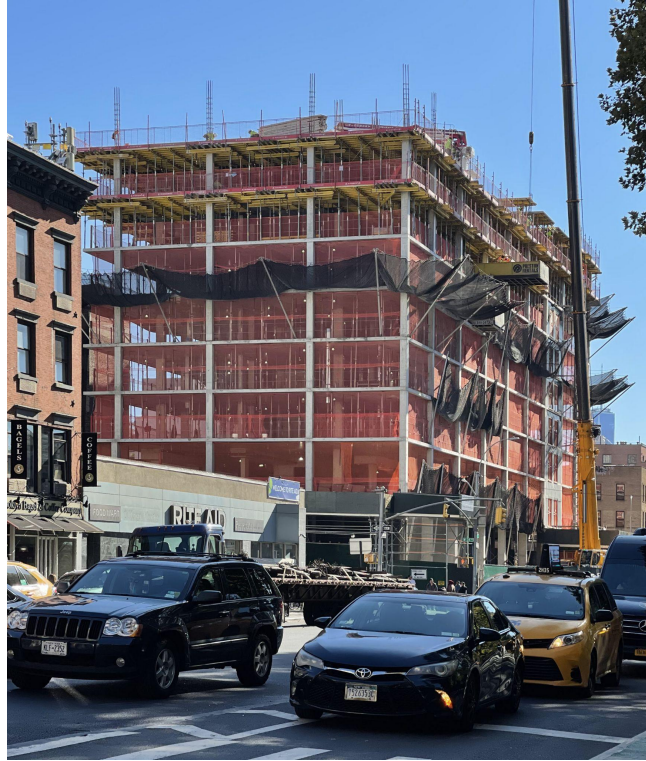
278 Eighth Avenue.