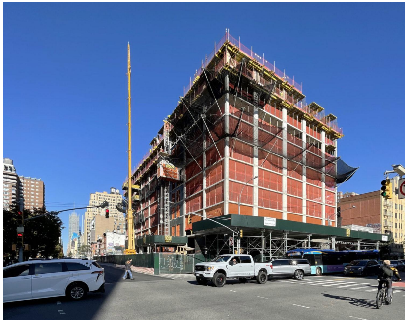
278 Eighth Avenue.