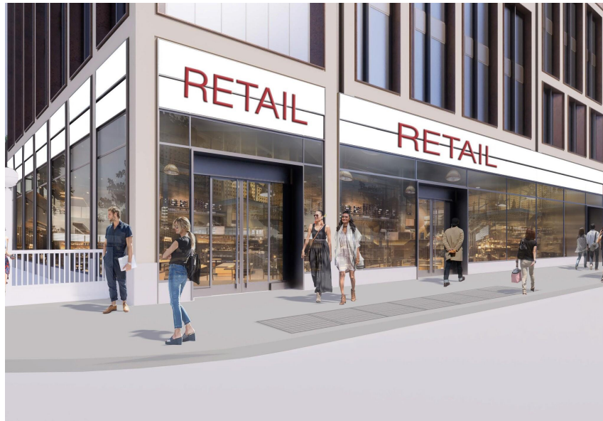
278 Eighth Avenue.

https://newyorkyimby.com/2022/10/278-eighth-avenue-passes-halfway-mark-in-chelsea-manhattan.html