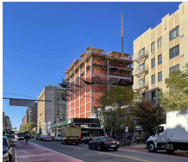
278 Eighth Avenue.