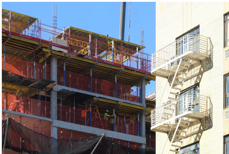
278 Eighth Avenue.