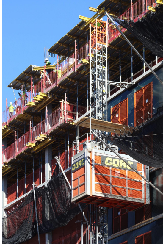
278 Eighth Avenue.