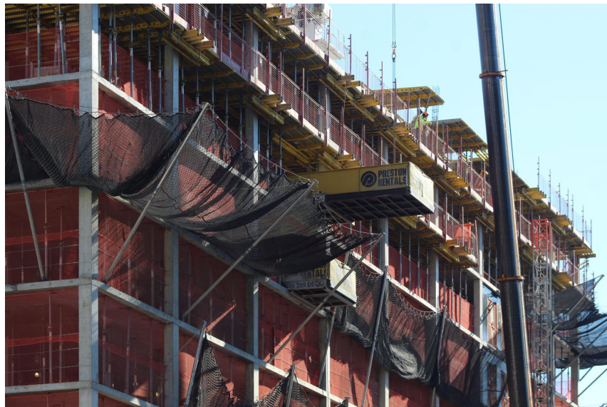
278 Eighth Avenue.