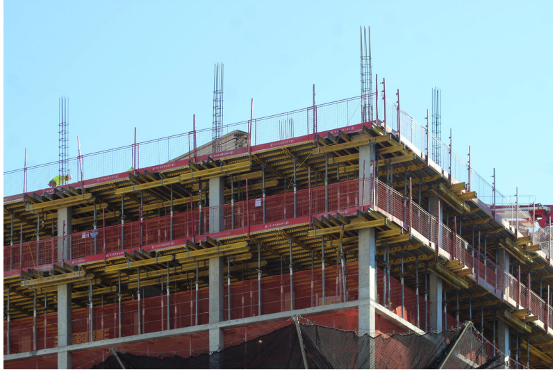
278 Eighth Avenue.