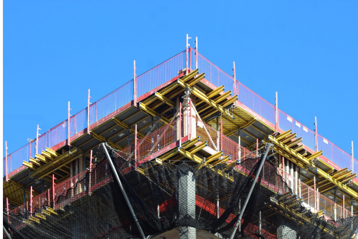
278 Eighth Avenue.