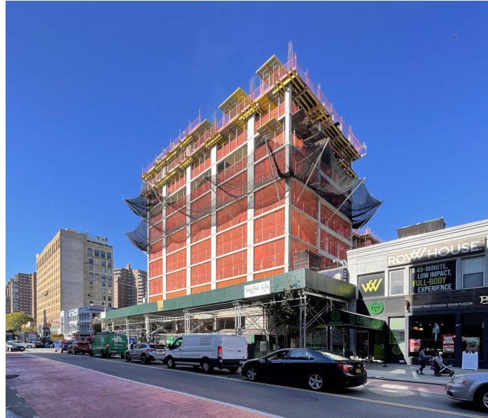
278 Eighth Avenue.