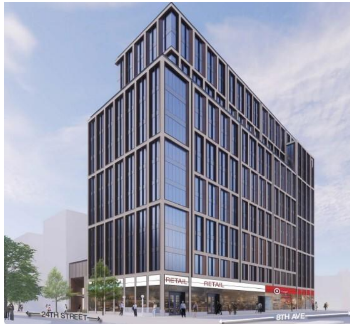
278 Eighth Avenue.