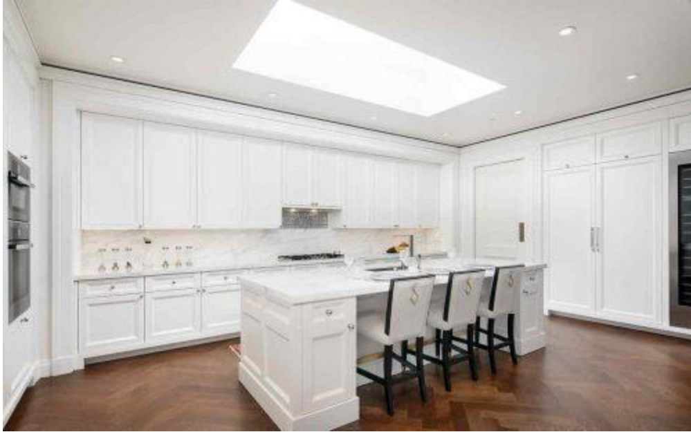
Pavilion A at the Woolworth Tower Residences