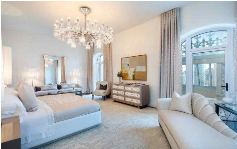
Pavilion A at the Woolworth Tower Residences