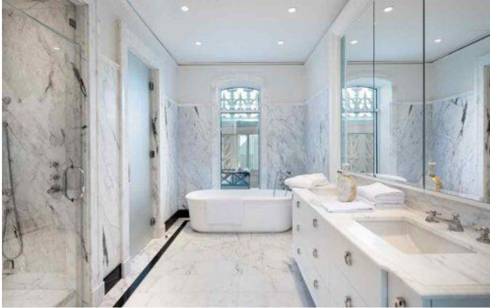
Pavilion A at the Woolworth Tower Residences (Travis Mark)

https://therealdeal.com/2022/07/06/woolworth-tower-apartment-featured-in-succession-sells-for-20m/amp/