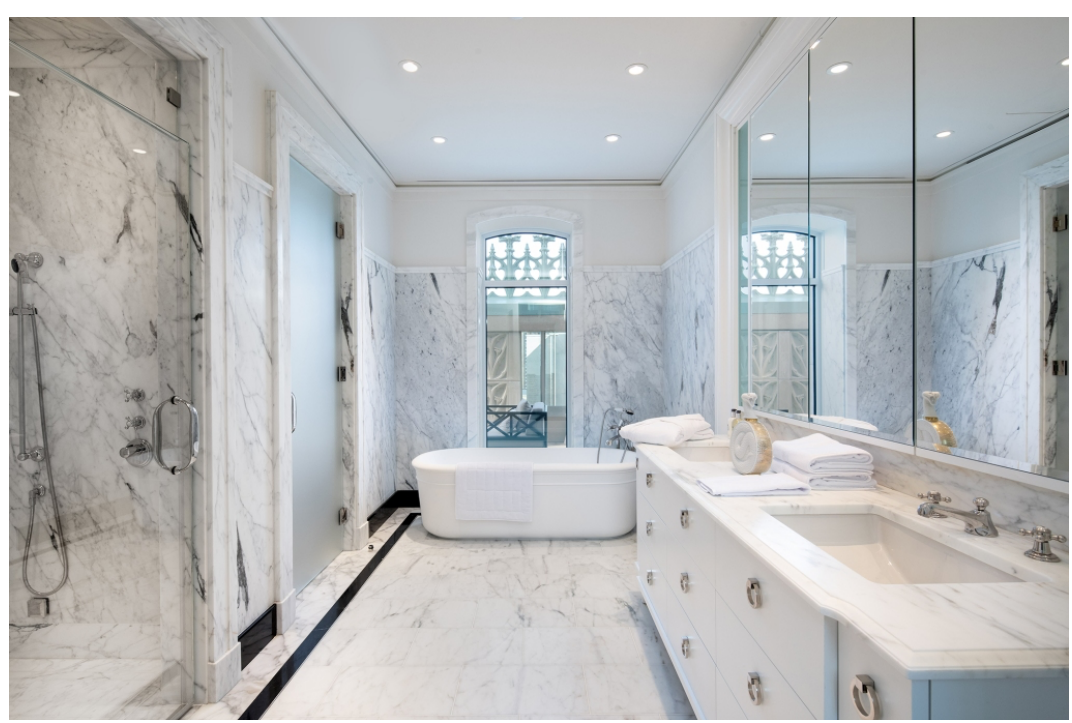
One of the home's four bathrooms.