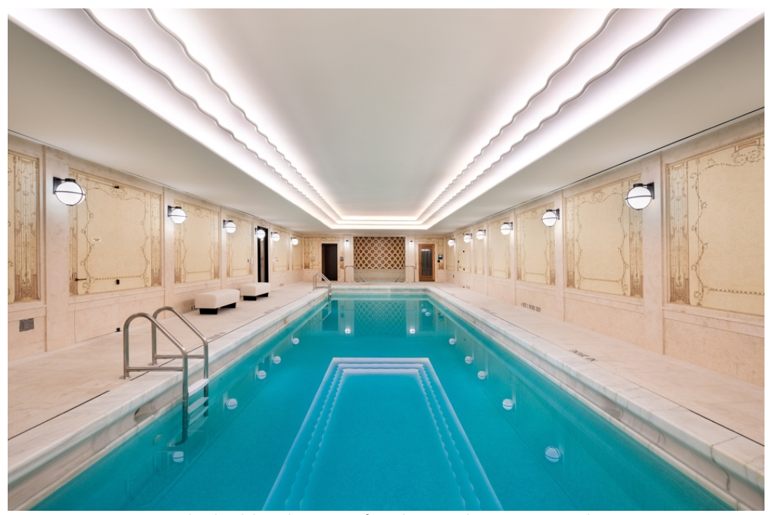
The building has a 50-foot lap pool.

The building itself was designed by Cass Gilbert in 1913 and — rising 792 feet high — was once the tallest building in the world.