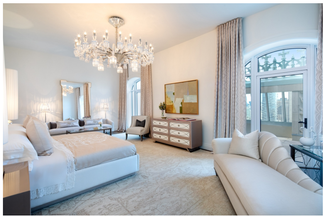
One of the five bedrooms in the Park Place palace.

That luxury residence, which first hit the market in 2019 and was last asking $23.35 million, just closed for $19.5 million, according to city property records.