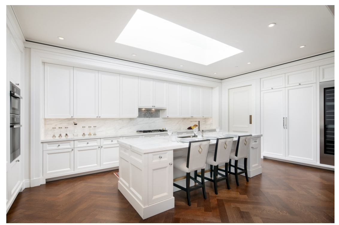
The home's open chef's kitchen.