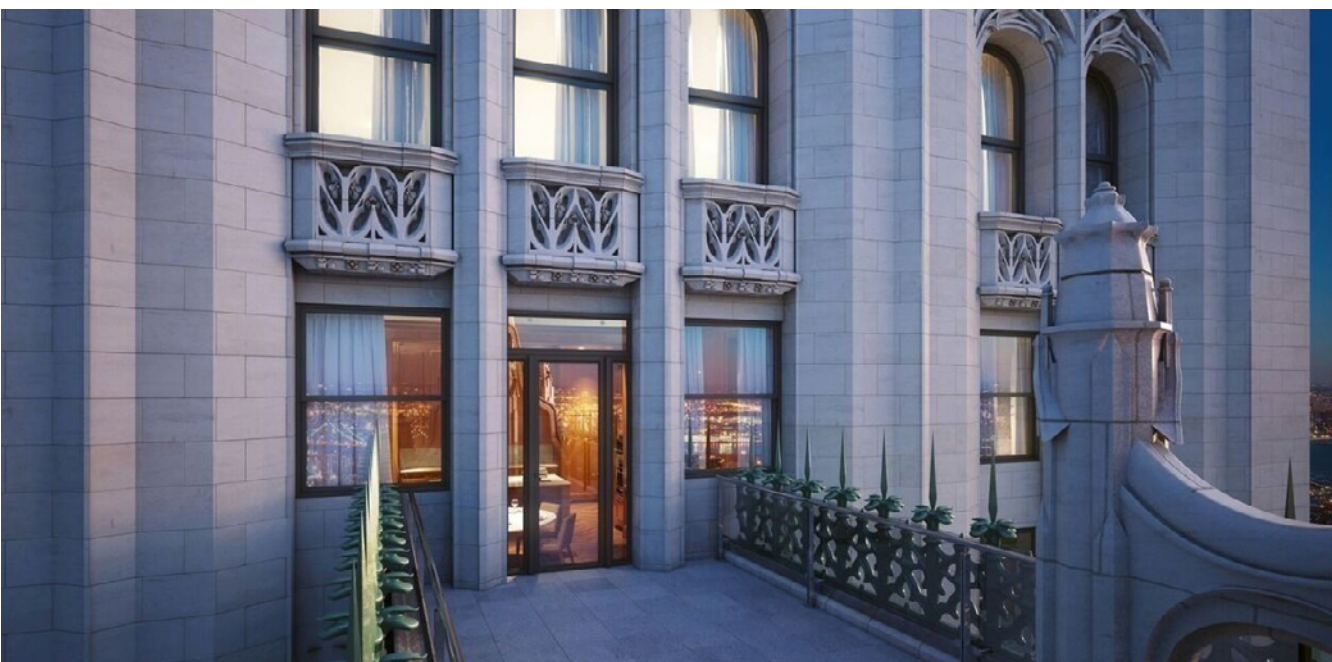
The Woolworth Tower Residences, NY