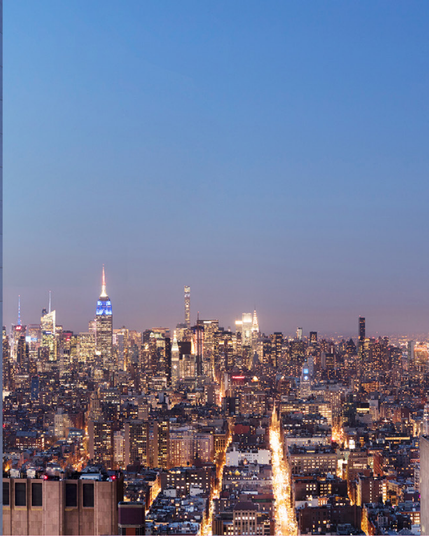
The Woolworth Tower Residences, NY