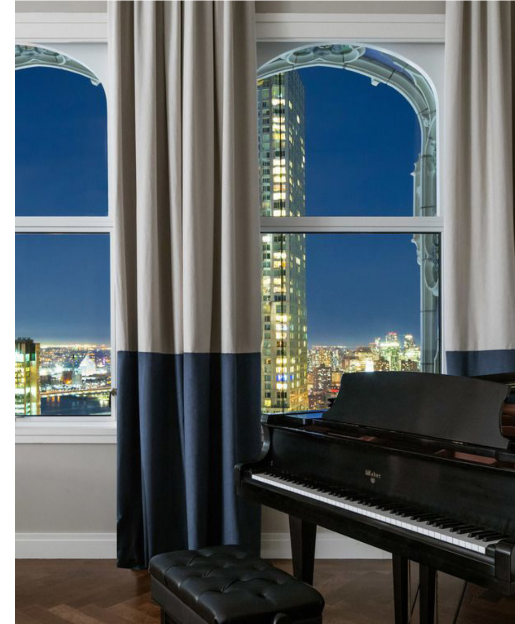
The Woolworth Tower Residences, NY

We also target existing office, retail, multifamily, industrial and mixed-use properties ranging from $25M to $400M which can be acquired at significant discounts to replacement cost or can be developed at attractive risk adjusted yields on cost. Core, core-plus, value-add and ground-up opportunities within the New York metropolitan area, South Florida, and other select high-growth markets.