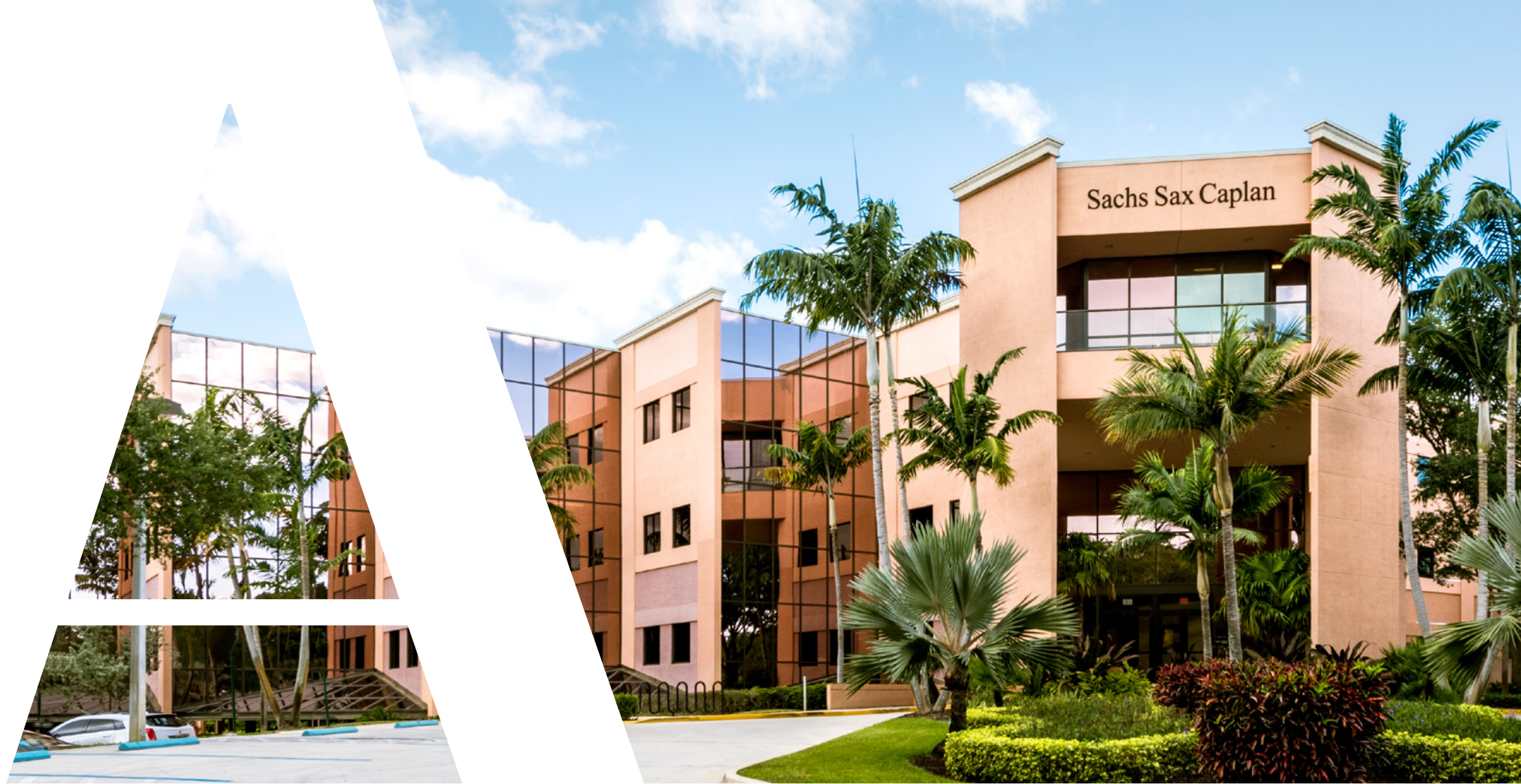
6111 Broken Sound Parkway, FL