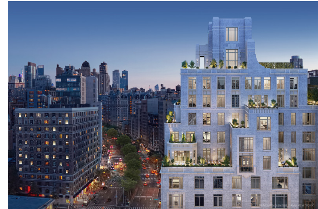
Two Fifty West 81st Street, NY

With a stellar track record, global relationships and wide-ranging hands-on experience in a diverse set of disciplines, we are poised to recognize and capitalize on unique and dynamic investment opportunities.