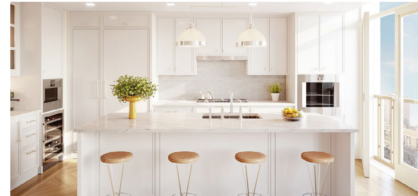
Two Fifty West 81st Street, NY