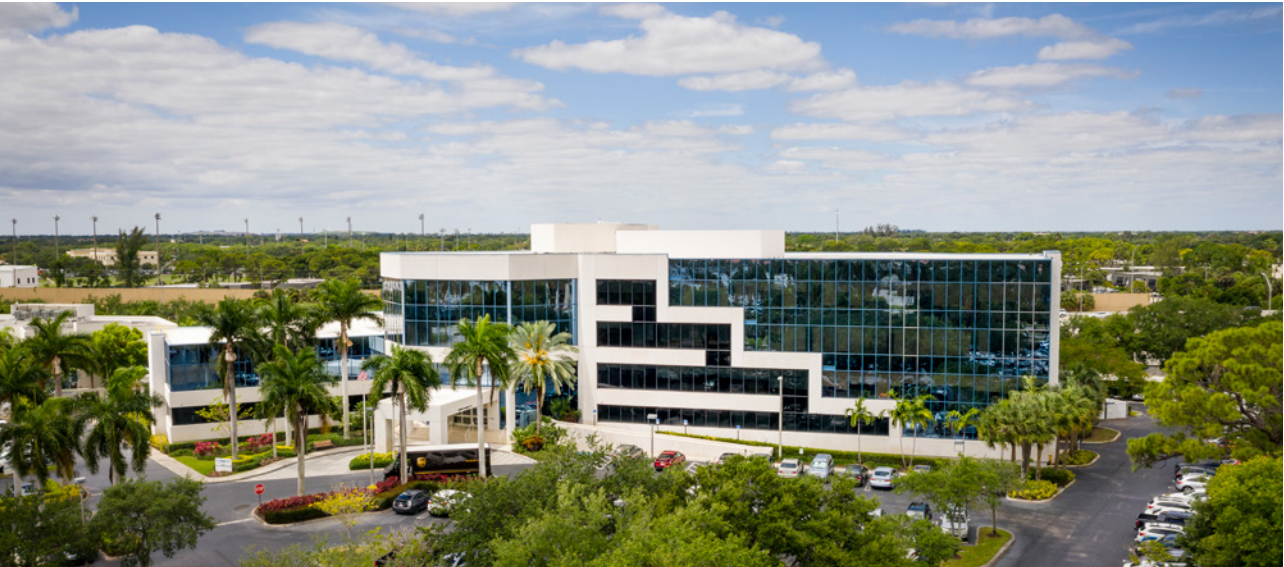
4200-4400 Northcorp Parkway, FL