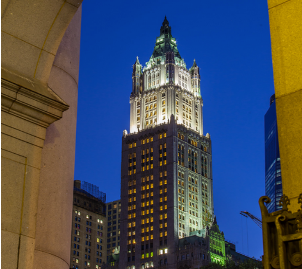
The Woolworth Tower Residences 28 March 2017