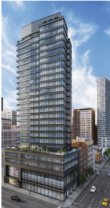
50 West 30th Street. Rendering: FXFOWLE Architects

Construction has topped out on The NOMA, a 24-story, 55-unit mixed-use tower, located at 50 West 30th Street on the corner of Sixth Avenue, in NoMad. YIMBY has exclusive photos of the topped-out structure. The latest building permits