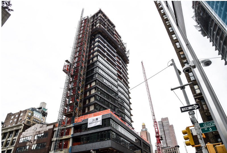
50 West 30th Street.

indicate the project encompasses 105,973 square feet and rises 315 feet to the top of the parapet.