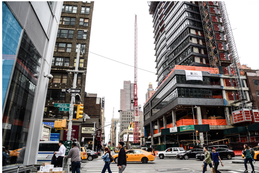
50 West 30th Street.

Alchemy Properties is the developer and FXFOWLE Architects is the design and executive architect. Occupancy is anticipated in December 2017.