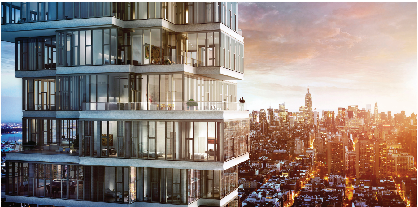
Photography / Renderings by: Herzog & de Meuron

The amenity space on the 9th and 10th floors will host a slew of five star amenities, such as 75-foot infinity pool with an adjoining landscaped outdoor sundeck and hot tub overlooking the Hudson River, fitness center with yoga studio, steam room and treatment room, library lounge, indoor/outdoor theater, private dining salon, catering kitchen, conference center, and a children's play area.