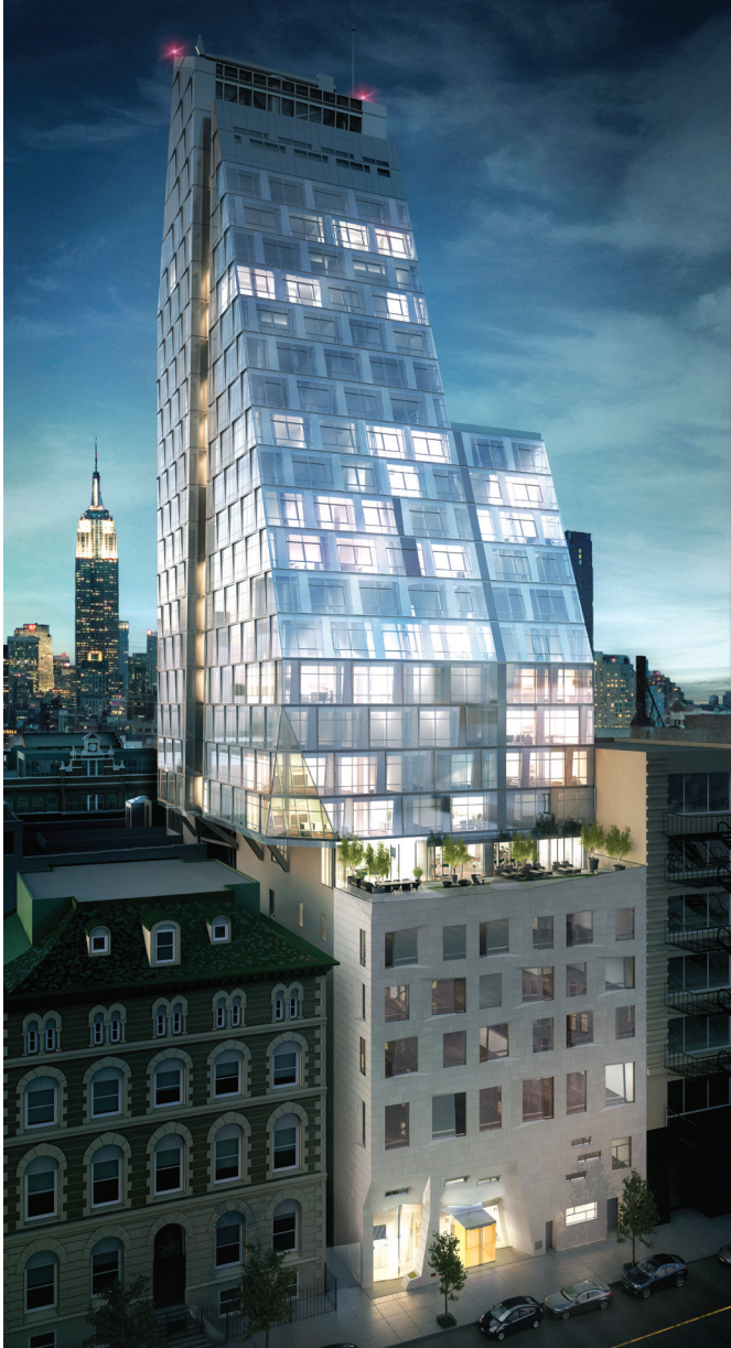
Artist Rendering by Williams New York

35XV is an iconic tower of glass and granite at 35 West 15th Street that benefits from all that Chelsea, Union Square, and Greenwich Village have to offer. The unique and stylish skyscraper, designed by FX FOWLE Architects and Benjamin Noriega-Ortiz, rises at an angle towards the sky, offering unprecedented views of the city and region with an abundance of natural light.