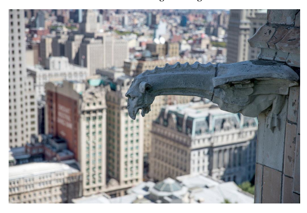
The Woolworth Building Re-Imagined

"I grew up in Brooklyn," he continued. "We would drive across the bridge and my father would say, 'Look at that building!' There are certain things, having grown up in New York, that everyone knows."