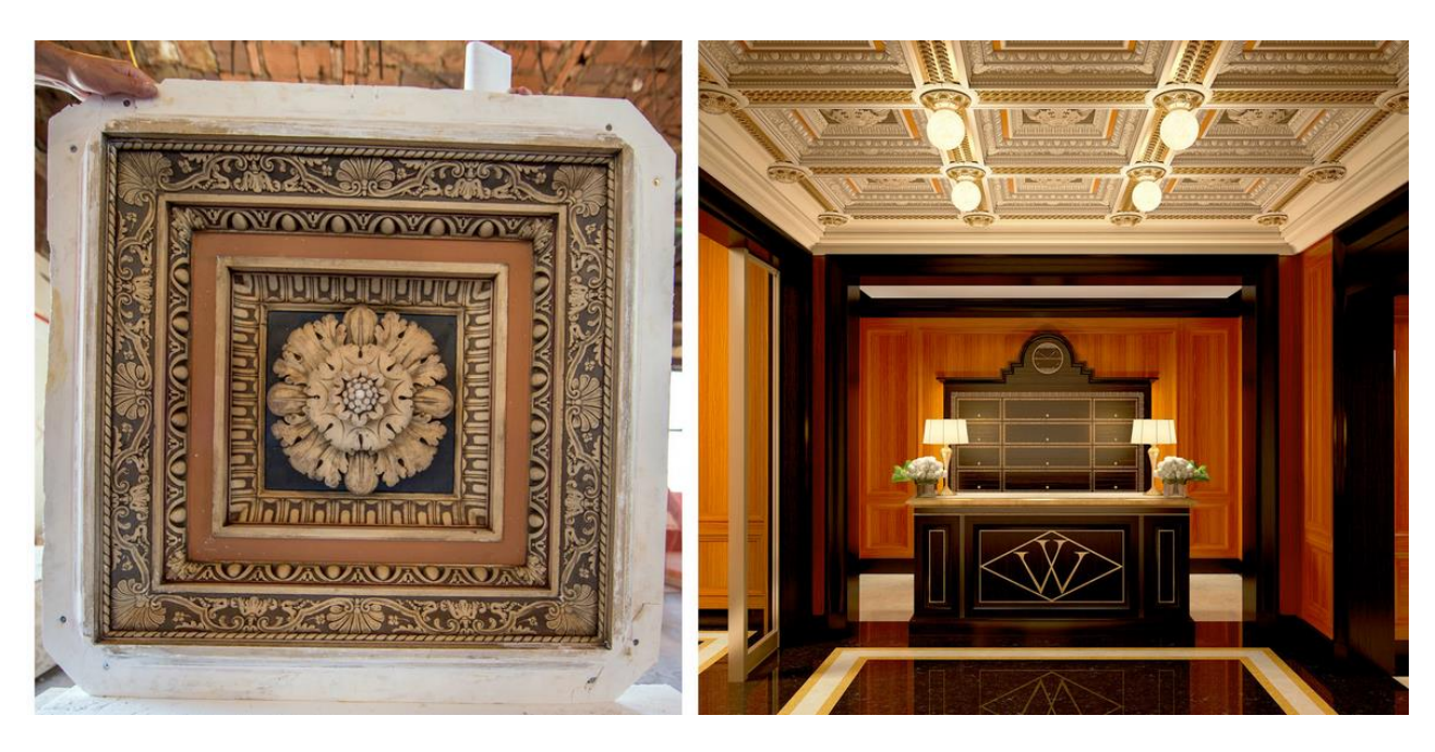
Left, one of the ornate ceiling coffers being resotred, reinforced and relocated from the 40th floor to the new residential lobby. Right, a rendering by Williams New York of the resorted ceiling coffers in the new residential lobby, which draws inspiration from the original vaulted mosaic lobby still used today by office tenants. The new lobby will have an entrance on Park Place, maple paneled walls and Crema Marfil, Indus Gold and Belgian Black marble floors.