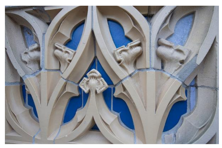
Some terra cotta is in need of repair.

"Here's the sweet spot," he said, gingerly lifting the lid to reveal a 101-year-old blue- and peach-colored plaster coffer with a new reinforced backing. "It's like as good as gold."