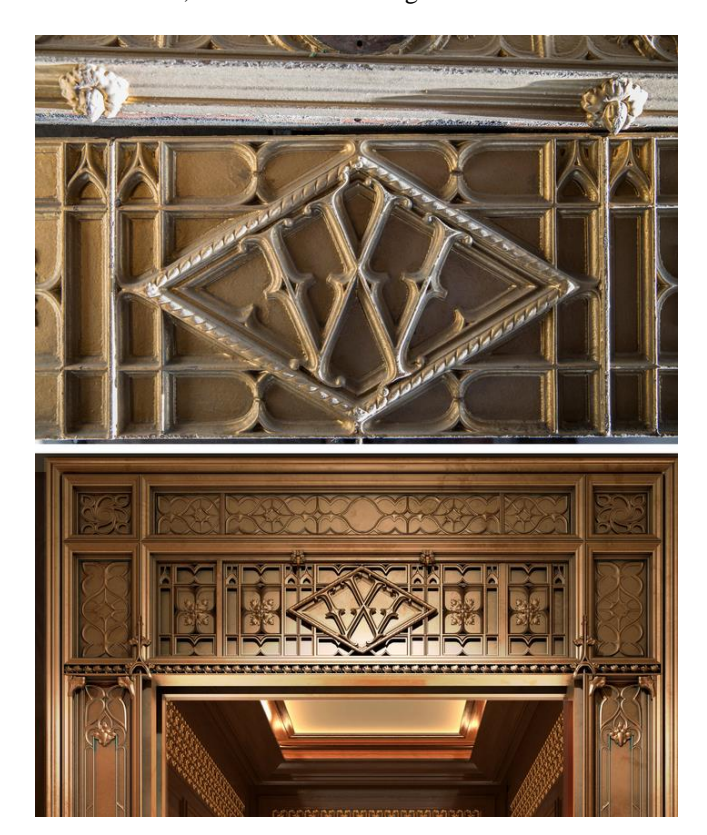
The Woolworth Tower Residences will feature W motifs throughout, like engraved doorknobs and marble kitchen back splashes cast from the original logos on the building elevators, above. Below, a rendering by the Williams New York of the new residential elevators.