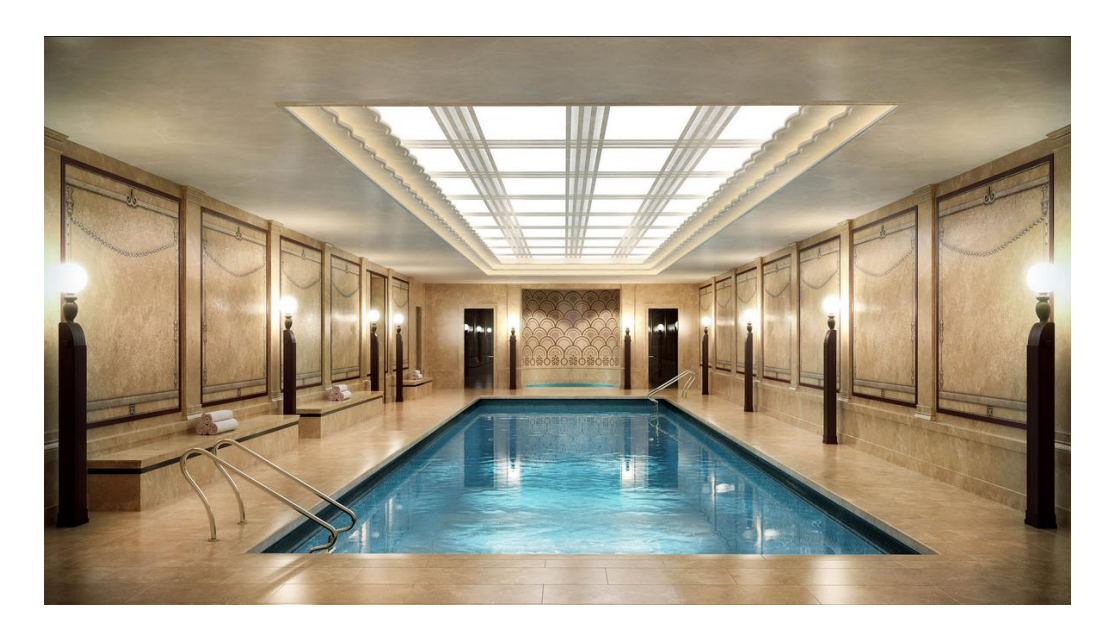
The abandoned 55-foot – long swimming pool in the basement of the building that was oringially commissioned by F.W. Woolworth is being reimagined with tiles by Bisazza Mosaico, a sauna and a hot tub.