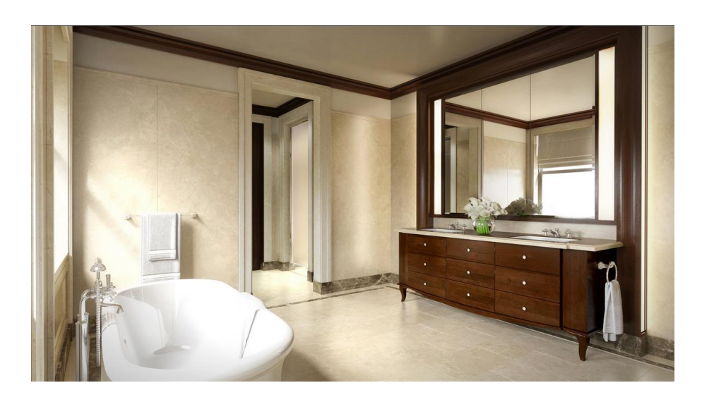
While the residences are scheduled for completion in 2016, the sales office is poised to open just a few doors down from the Woolworth Building. Inside, an opulent model apartment showcases pre-war proportions and marble-clad bathrooms.